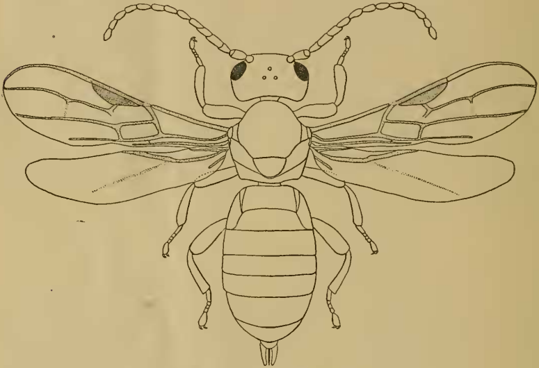
FIG. 42. TERMITOBRACON EMERSONI SP. NOV.

stigma broad, dark, but not heavily chitinized, the radial cell broad, attaining the wing tip; three cubital cells although the transverse cubiti are in great part hyaline; nervulus strongly postfurcal; nervellus interstitial; hind wing without nervulus or marginal vein.